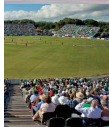
PAGE 16 SPORT IS BIG BUSINESS