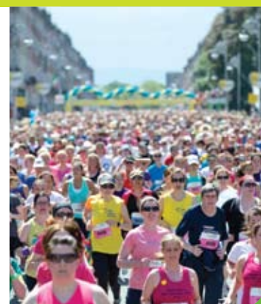
PAGE 10 SPORT - THE KEY TO A HEALTHIER IRELAND

Chief Executive Officer Federation of Irish Sport