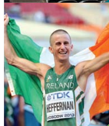
PAGE 18 ENHANCING OUR REPUTATION WORLDWIDE