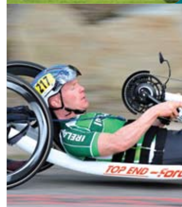
PAGE 14 BUILDING AN INCLUSIVE SOCIETY