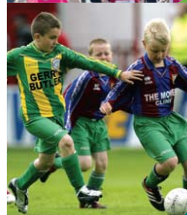
PAGE 12 GREATER INVESTMENT NEEDED TO KEEP CHILDREN IN SPORT